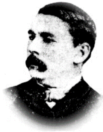
Joseph Scriven (1819-1886)

Let me conclude by revisiting the theme of comfort. Jesus has promised us, “I will not leave you comfortless: I will come to you” (John 14:18). Perhaps one person, more than many, whose life attest to the power of Jesus’ comfort, is Joseph Scriven (1819-1886) from Northern Ireland. Just before he married at the age of 23, his fiancé drowned. Sorrowful, he left for Canada where he fell in love again and was due to marry in 1860 when his new fiancé fell sick and died. He decided to live a life of poverty dedicated to Jesus and was comforted. When he heard that his mother in Ireland was very sick, and he was too poor to visit her, he wrote a poem to comfort her which we know today as “What a friend we have in Jesus”. Only a man who knew such sorrow and the power of Jesus’ grace to comfort the brokenhearted could move the Christian world with such a powerful and timeless hymn. May the Jesus who comforted Joseph Scriven and his mother comfort us!